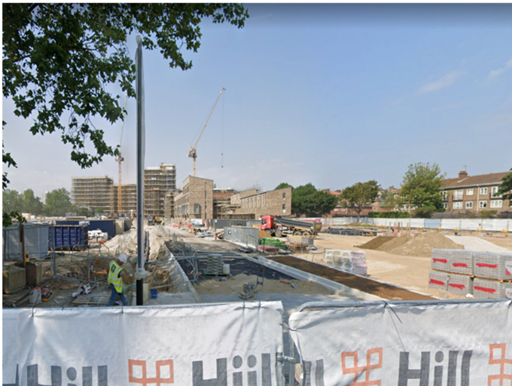
Photograph 2: The FDS C site, shown in the foreground of the photograph looking west and demonstrating its current condition as a construction site. (taken on 9th February 2022).