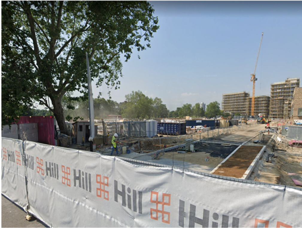
Photograph 1: The FDS C site, shown in the foreground of the photograph looking west and demonstrating its current condition as a construction site. (taken on 9th February 2022).